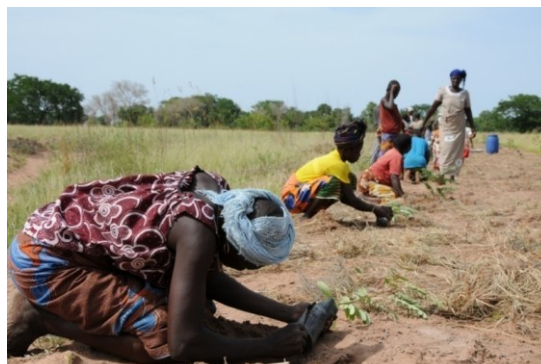
Project 09/77 APFG – activities of reforestation in the province of Poni, Burkina Faso

Throughout the year, 25 dossiers of projects for which execution reports had been received have been the object of an internal evaluation. In some cases, they are intermediary reports as the project has not finished. On the basis of the reports received, the conclusion was positive for all evaluations. However, it needs to be recalled that for the most part an assessment of viability and impact can only be made in the medium to long term.