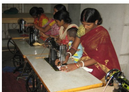
Projet 10/013 SMVS: Sewing training to start micro businesses – west Bengali, India

Since our objective is to translate the solidarity of the colleagues from the European institutions towards the Third World by funding development projects in those countries, we decided at the beginning of the year that we should also support the internal organisations that share our goals. Thus, we launched with the Schuman Trophy a partnership action. This today translates into a complementary contribution to three projects that were selected by the Schuman Trophy. Our contribution funded the classroom desks for a school in Benin, the electrification of a school in Mali and school furniture in Uganda. ETW's contribution amounted to 8.905 €.