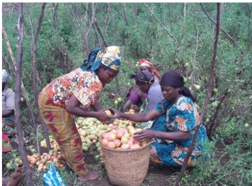
Project 08/54 Solidarité Féminine - RDC

Improvement of the revenue of 150 women by tomato production, in the territory of Kabaré, sud-Kivu.