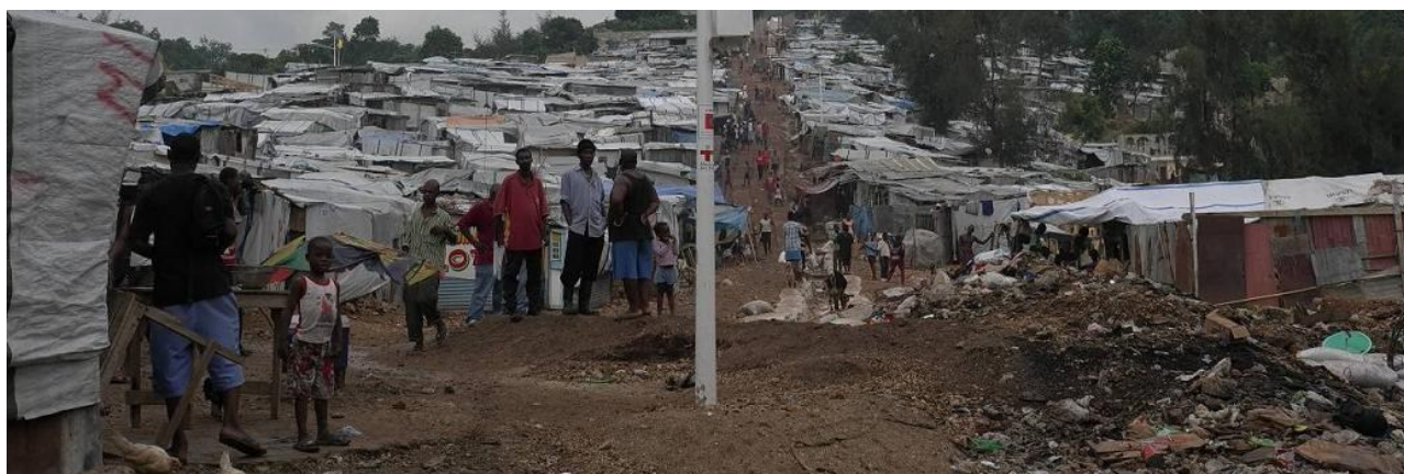
Project 10/44 Electriciens sans Frontières in Haiti – emergency aid: distribution of 450 solar lamps.

The action « Become ETW Ambassadors » did not have the expected success. Few colleagues responded to our call to display, as a symbol of their engagement and support to our goal, an A3 poster on their office door with the overview of the supported projects in 2009. Several did display the posters but did not inform us about it.