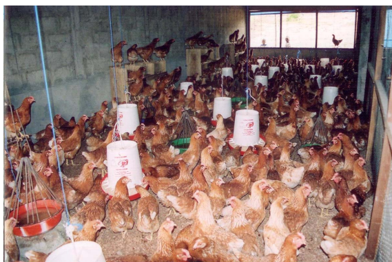
Establishment of a poultry farm for families affected by HIV/AIDS. 23 families benefit from additional income thanks to this project.

2010 was characterised by the enormous success of the special collection for Haïti. These funds could only be spent through projects received and deemed acceptable, which is one of the main reasons for the 61.7% drop in donations and collections, the other of which is, though to a lesser extent, the 20% increase in projects financed.