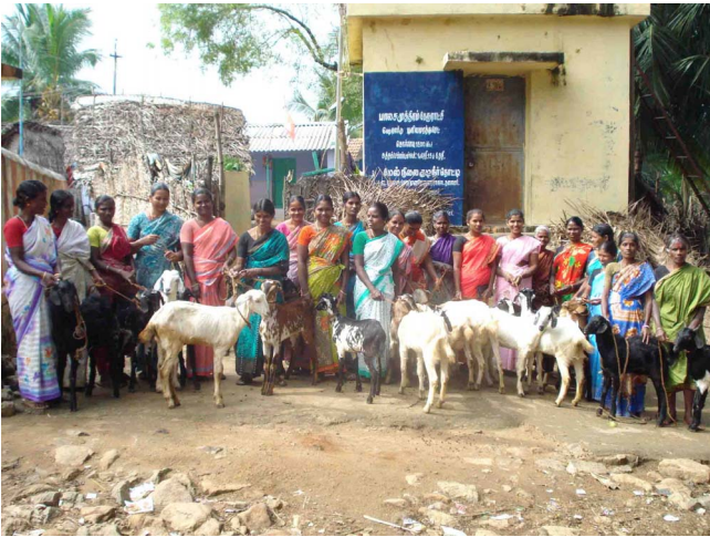
Project 2010/22 – Award Trust - India: Raising goats generates revenues for 75 beneficiaries.