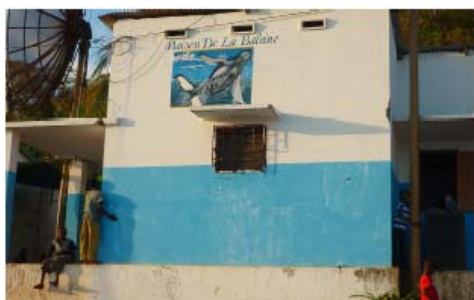
Projet 2009-38 Megaptera – Comores: Creation of a whale house to develop ecotourism for the benefit of the fishermen.