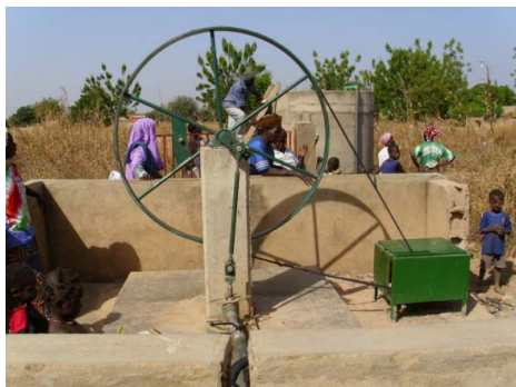
Projet 2009/64 Wênd Pênga = Burkina Faso: conveyance of water by solar energy, supplying drinking water and improving agricultural yields

ETW would like to warmly thank all its occasional and regular donors for the support they have given us.